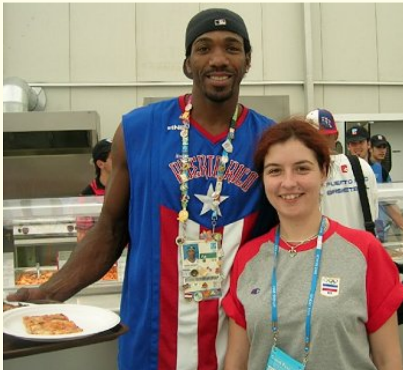
With a member of the disrespectful Puerto Rico basketball team (which defeated the "Dream Team" of the USA)