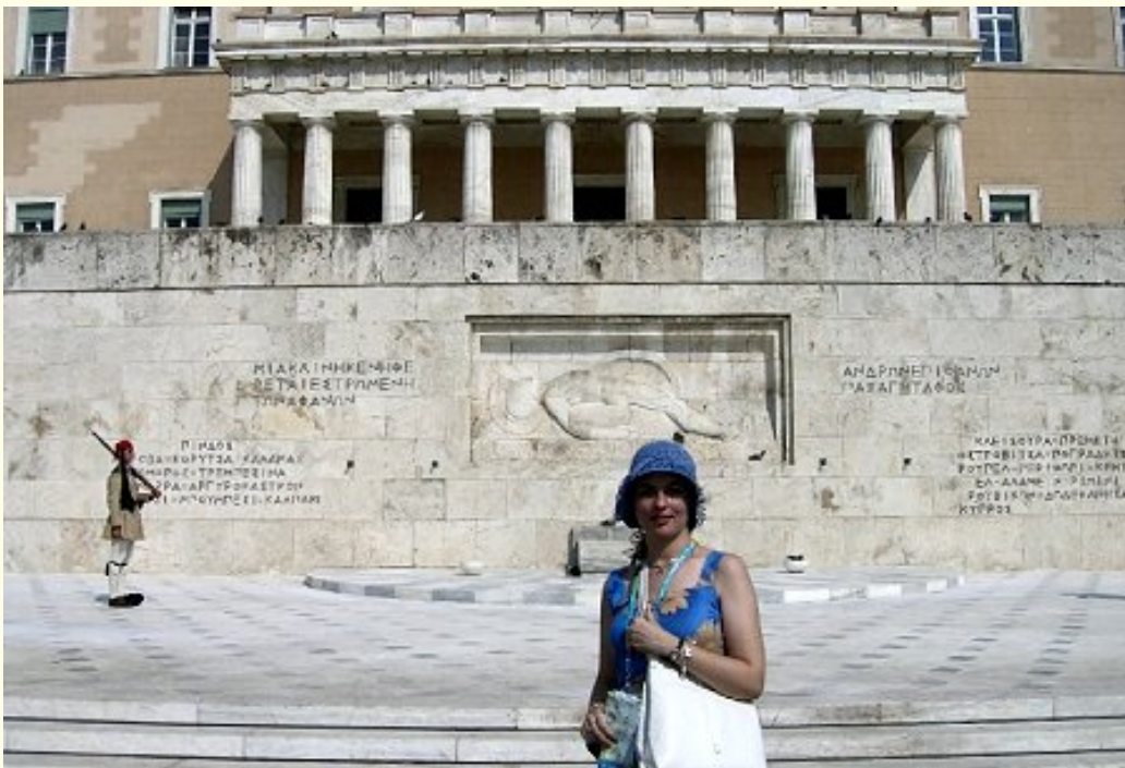
The famous Syntagma Square with a Parliament guard in the background