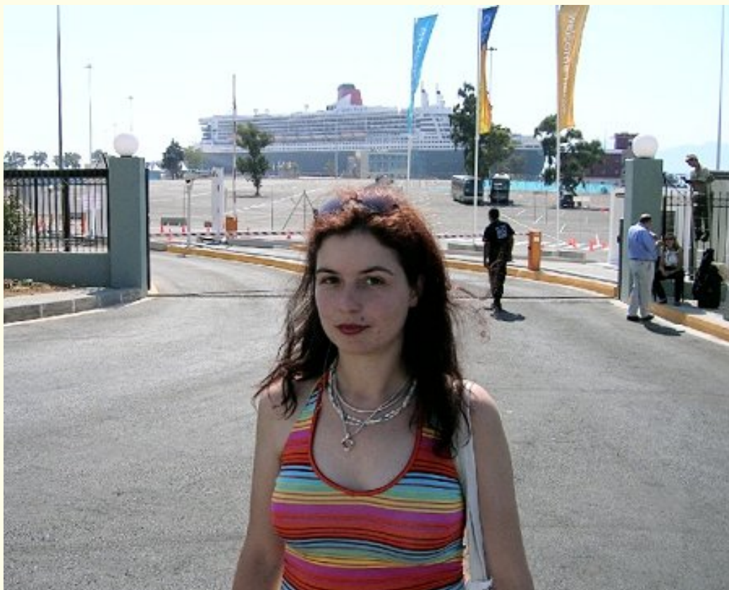
The world's largest passenger ship, the Queen Mary II, was attraction of Piraeus.