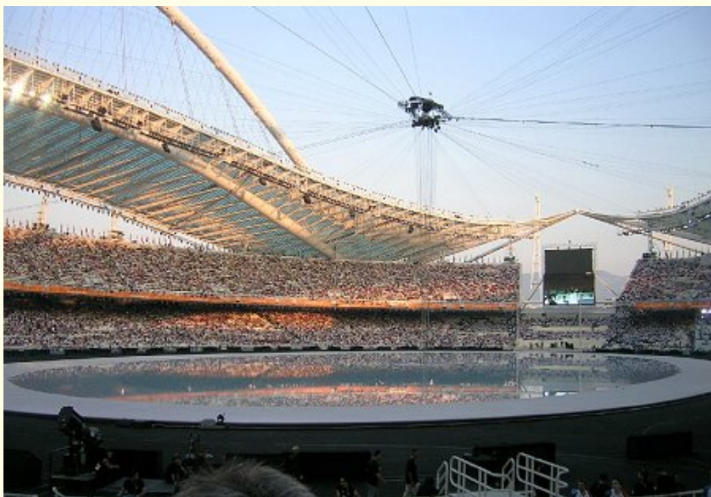
Oh what a feeling! This is something to remember for the rest of your life.