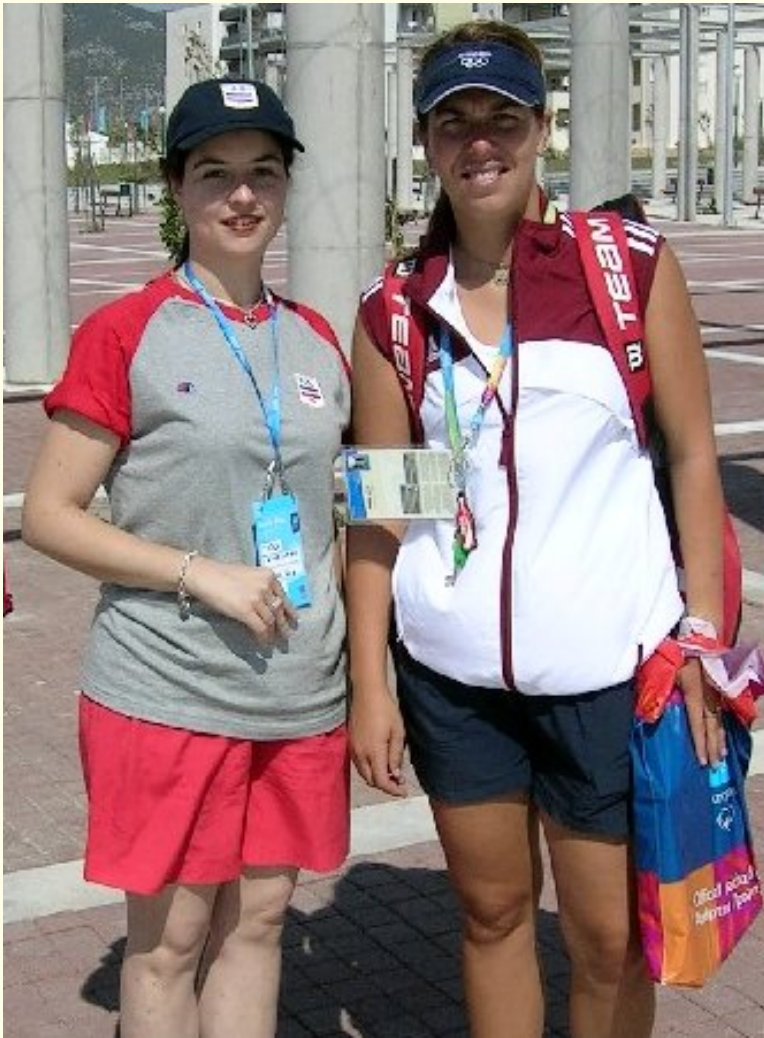
With US tennis star Jennifer Capriati