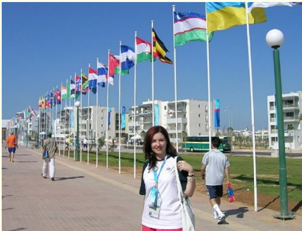
A properly accredited Alisa in the Olympic Village, with all the national flags