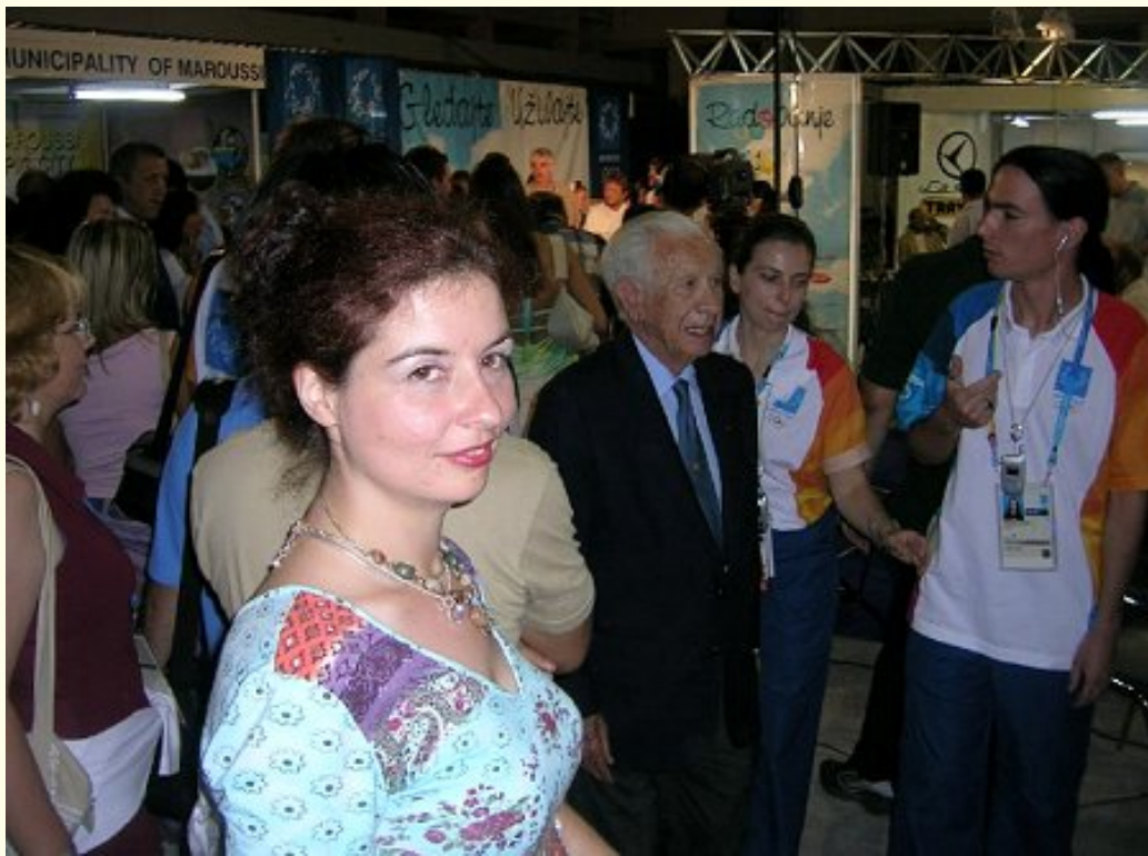
At a party given for former IOC president Juan Antonio Samaranch (middle)