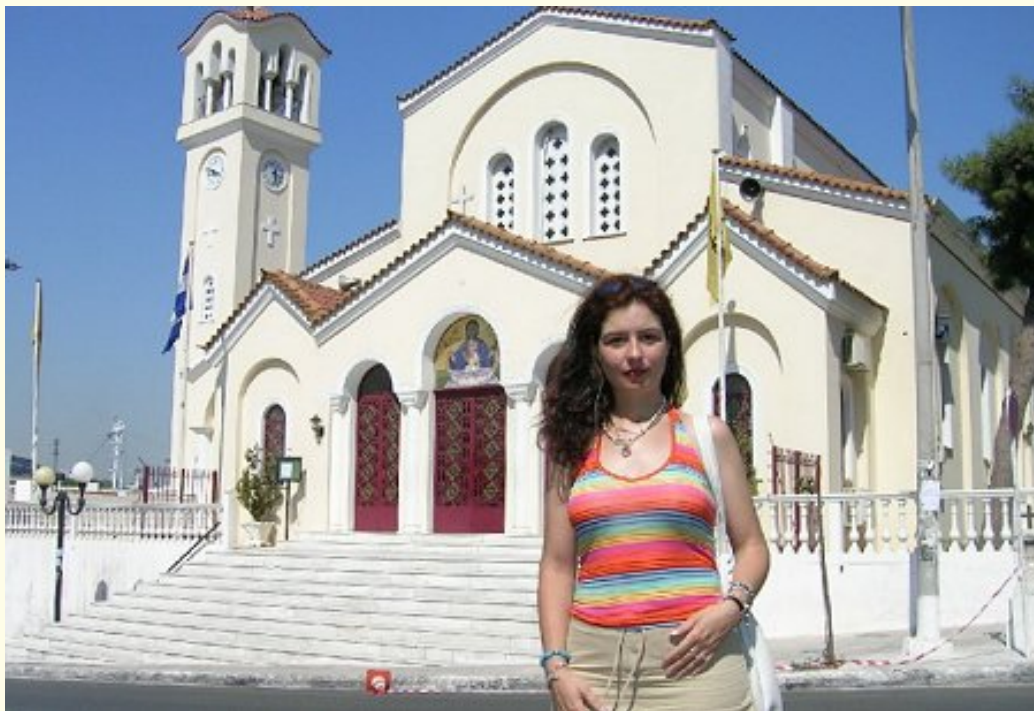
Athens is history ... visiting a church in Piraeus