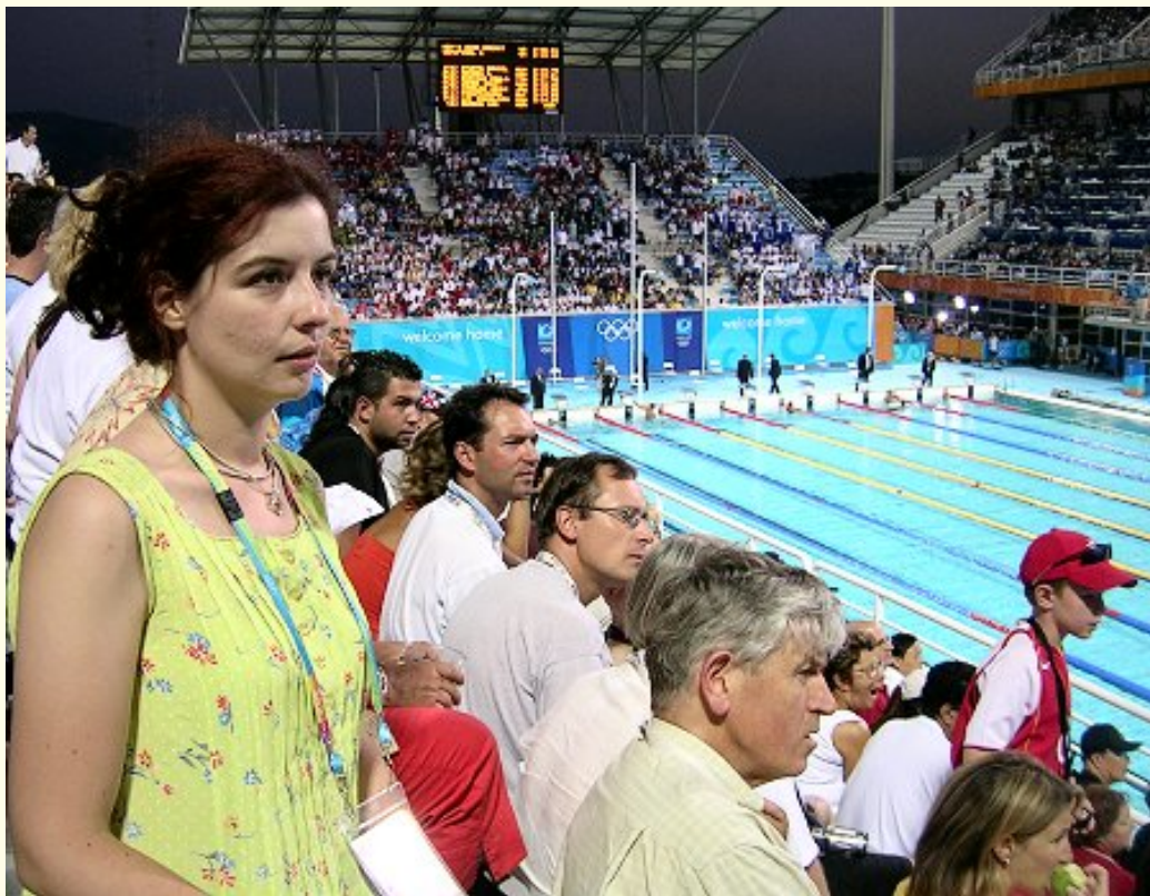
The swimming competitions were among the most exciting