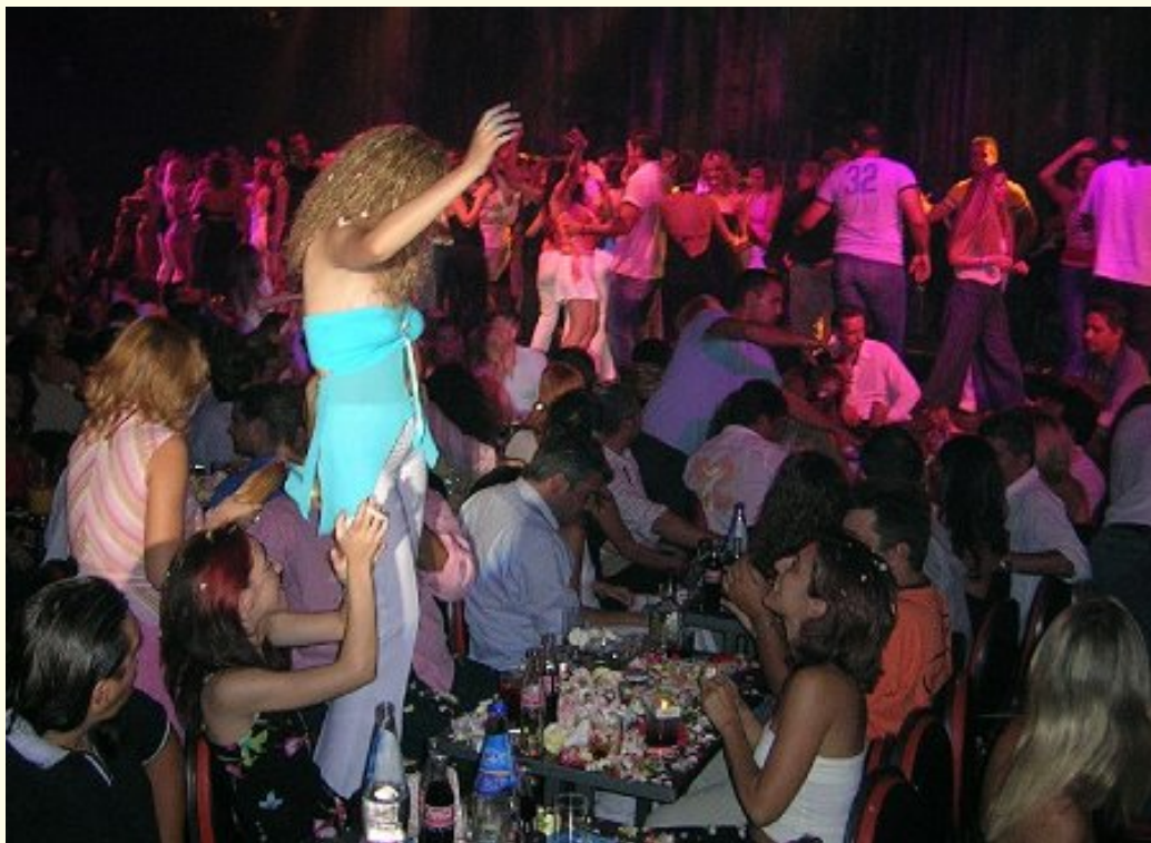
Bouzouki night! The atmosphere is hot, and we are not talking Centigrade or Fahrenheit.