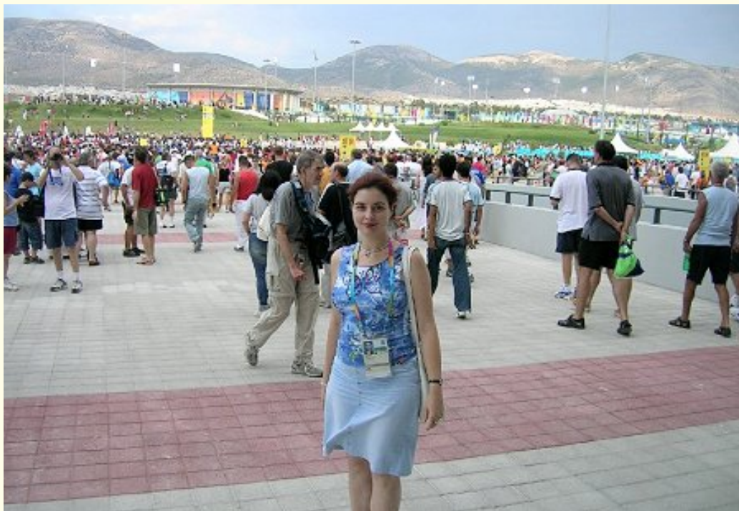
See you again, Athens!