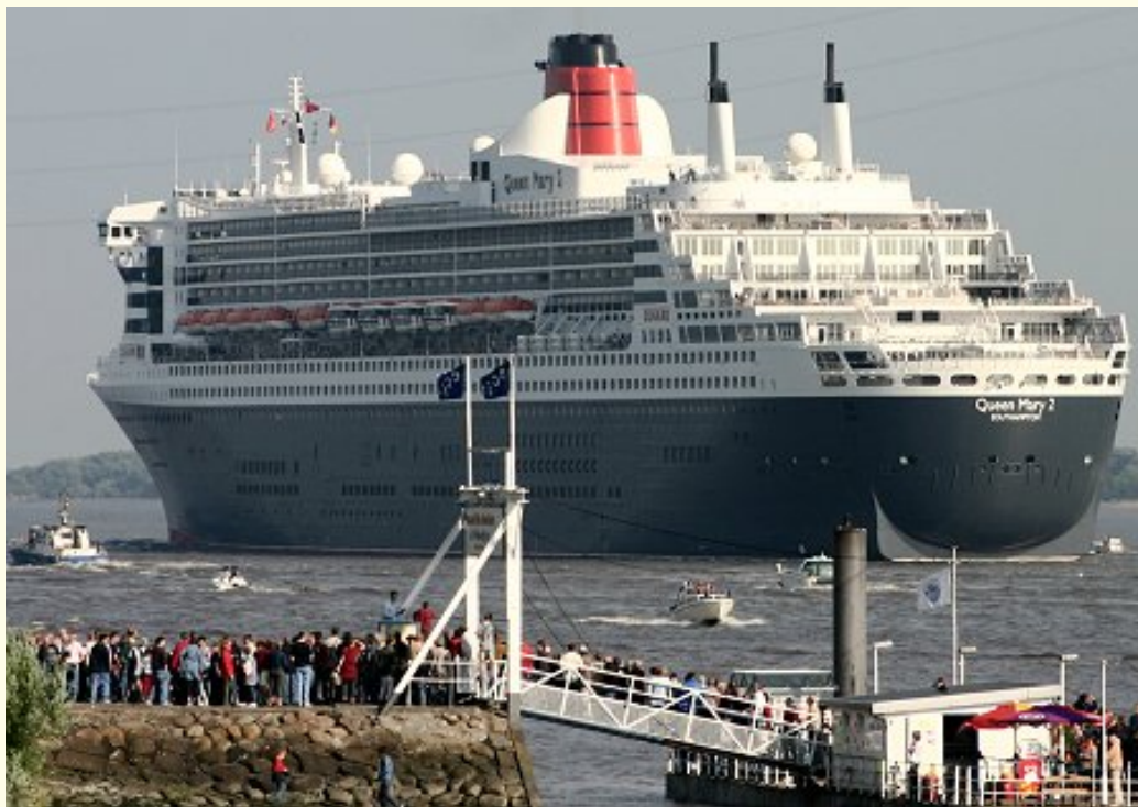
They don't come bigger – or more expensive: the Queen Mary 2 sails from port